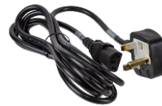
100-230VAC IEC AC Cord, 1.8m UK