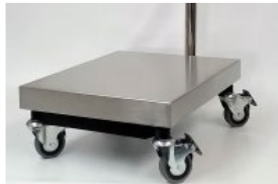
Optional castor wheels for mobility available