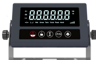
Indicator Installed with U-Bracket