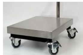
Optional castor wheels for mobility available