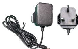
3 Pin Power Adaptor