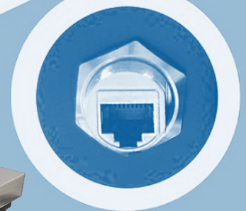
Ethernet (RJ45) Interface

GTW-IP with RJ45 RJ45 Data Transmission Scale - IoT Made Easy