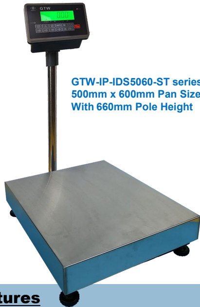
GTW-IP-IDS5060-ST series 500mm x 600mm Pan Size With 660mm Pole Height