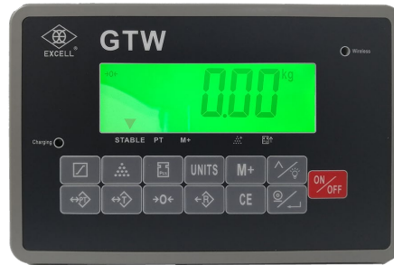
13 Direct Access Key with Various Functions