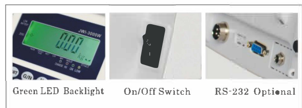
Green LED Backlight