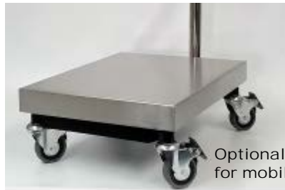
Optional castor wheels for mobility available