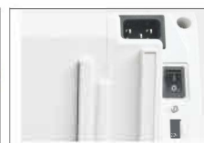
Power supply & Switch